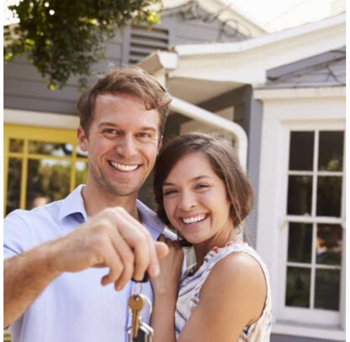
For the Buyers